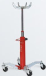
Transmission Jacks Capacity 0.3 up to 1.2 t