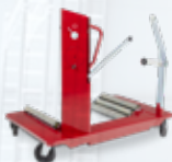
Wheel Dollies Capacity 0.5/1.5 t