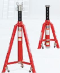
Foldable Axle Stands Capacity 8.5 up to 12 t