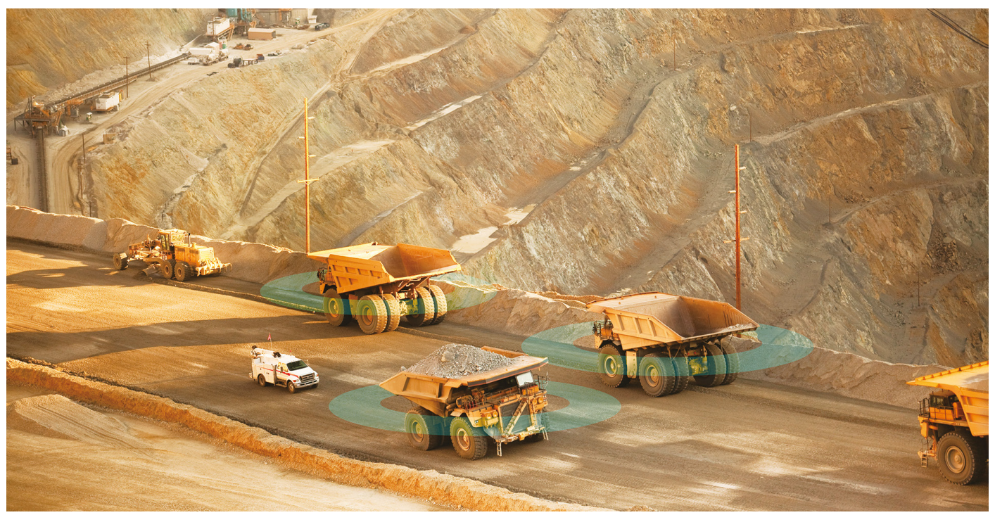
ADAS for collision avoidance in mining

The ATC 3750 and ATC 3540 mobile computers minimise expenses through rapidly detecting real-time information using IP cameras, mmWave radar, or lidars, achieving blind-spot monitoring and licence plate and face recognition for criminal and civil enforcement. Pairing with stereo cameras, they can detect and estimate ambulance speed, helping open a pathway of green traffic lights for the fastest route.