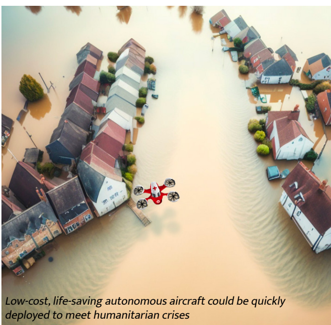
Low-cost, life-saving autonomous aircraft could be quickly deployed to meet humanitarian crises